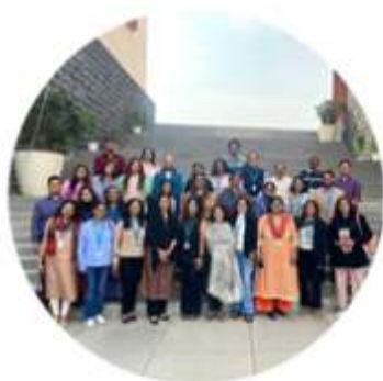
Understanding the DNA of Plaksha University