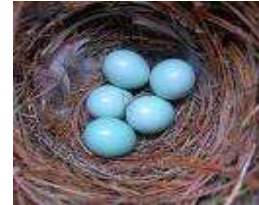
Eggs in the nest